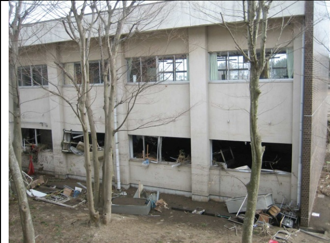
Photo 3: Broken windows in the 1-st story (north face of the South Building)