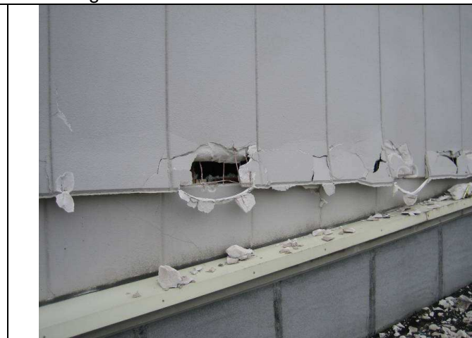
Photo 4: Breakage of ALC (autoclaved light-weight concrete) panel (Building 2)