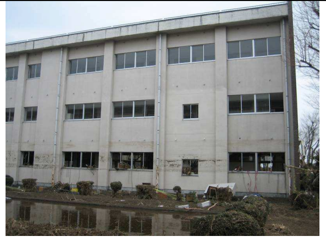
Photo 4: North face of the Central Building (the tsunami reached approx. 1 m above the first story windows)